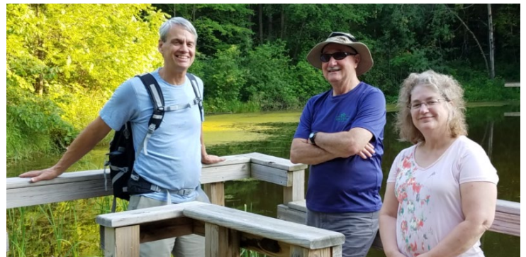
Evening Hike at Purdy Nature Preserve - July 19th

Outings: Get outside and join us on one of our outings! They are a great way to meet other outdoor enthusiasts. Outings are open to members and non-members alike. In order to participate, sign up at one of our general meetings or contact the outings leader directly. Time and meeting locations of outings can change. Some trips are weather dependent. Times are not listed in these descriptions to ensure participants will check with trip leaders before proceeding.