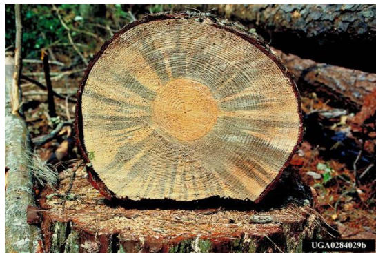
Blue Stain fungus

During the winter the beetle's eggs hatch and the larvae feed on liquid in the Cambium layer. The liquid in the Cambium layer contains sugar which turns into alcohol in the Larvae. Hard winters with cold temperatures (-30 to -40 F for 3-4 days duration) can kill beetle eggs and larvae wintering under a tree's outer bark. Related to general climate warming, average winter temperatures in the Rocky Mountains have been higher than normal over the past ten years. Trees have also been weakened by a prolonged period of low precipitation (drought). The combination of milder temperatures and low precipitation has aided a vast outbreak of beetles a direct result of climate change!