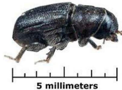
Size of Pine Bark Beetle

There are 17 native species of bark beetles in the family that are known to occur in RMNP. Periodic outbreaks of native bark beetles have occurred throughout the history of the park however none have been as severe as the recent outbreak. Though bark beetles cause a substantial loss of trees, they are recognized as part of "natural conditions." Several species of bark beetles are presently killing lodge pole pine, ponderosa pine, limber pine, Engelmann spruce, subalpine fir and Colorado blue spruce.