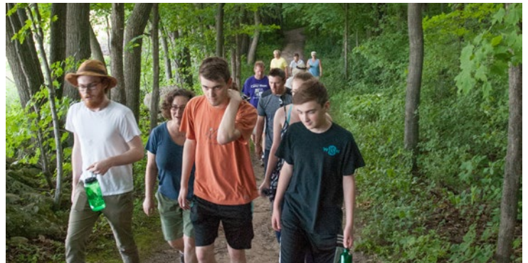
Summer Solstice Hike at High Cliff State Park - June 20th