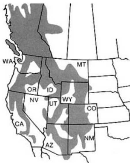
Current Range of Pine Bark Beetle Infestation.

Bark beetles are native insects that have shaped the forests of North America for thousands of years. Bark beetles range from Canada to Mexico and can be found at elevations from sea level to 11,000 feet. The effects of bark beetles are especially evident