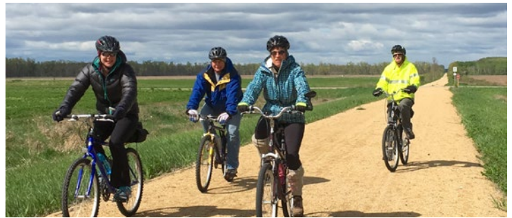
Biking the Newton Blackmour State Trail - May 14th

Join us for a fall hike on the New Hope Segment of the Ice Age Trail. This hidden gem of a trail winds through beautiful mature forests and near small lakes. This hike is about 6.4 miles and will take about five hours. Bring a lunch, as we will be stopping for lunch on the trail. Be sure to bring water, as there is no water available. There are no restrooms. We will meet at the 10 am at the Ice Age Trail parking lot. The trailhead is about an hour west of Appleton. Take Highway 49 north of Iola, go west on County Road Z, 1.8 miles to the Ice Age Trail parking lot. Contact Margaret Klose, 920-585-1948, margaretklose@gmail.com or Phil Snyder, 920-740-4338, hikerphil@icloud.com.